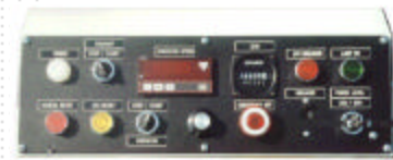
Full function control panel